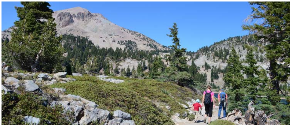
The Bumpass Hell trail affords spectacular view of the surrounding landscape including Lassen Peak.

Please carefully step off to the side of trail to allow uphill hikers to pass or to stop for a break.